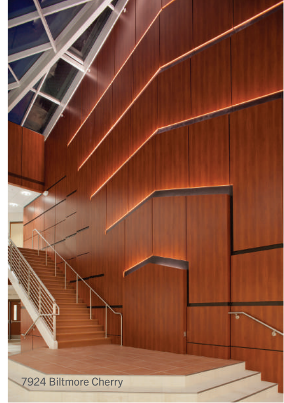
*Availability subject to change without notice. See Wilsonart.com/Compact for updated offer.